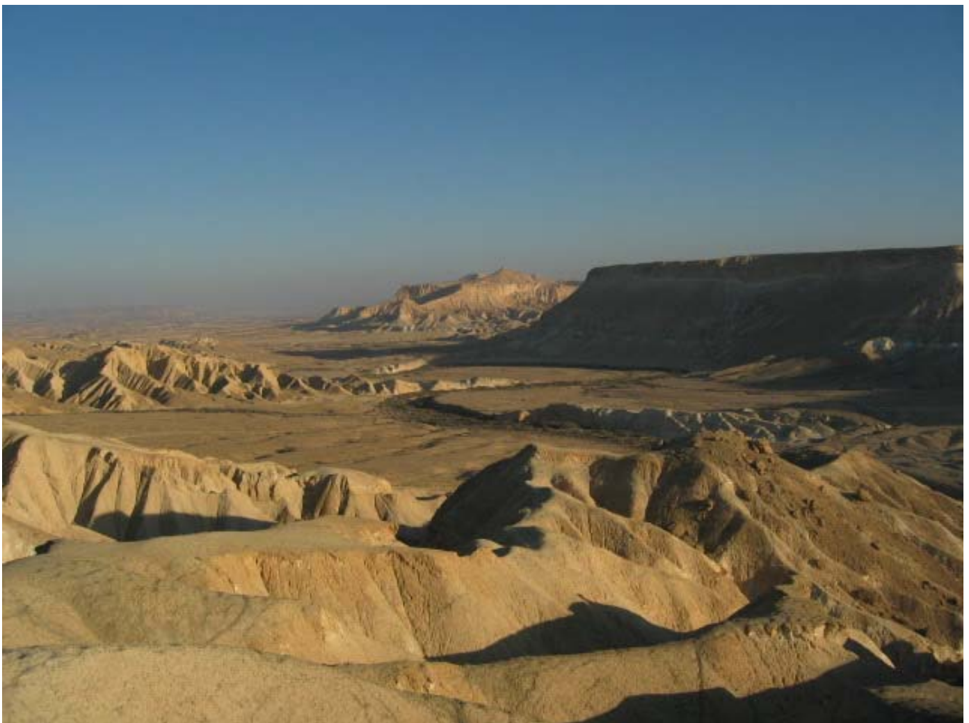
Sand Mountains in the Negev, Israel